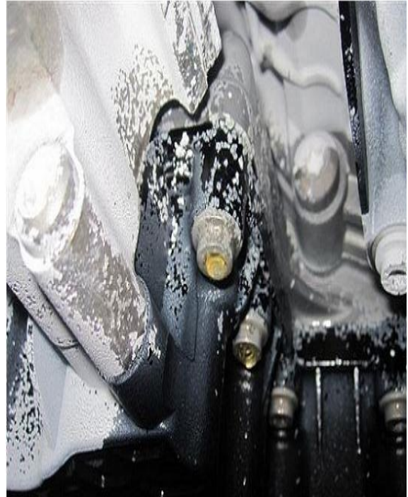
Figure 3. Oil leak.

Tip: If there are drips after the test drive as shown (Figure 3) you should be able to determine if the leak is from the ATF sump gasket or if the leak is from elsewhere. Make sure to check for leaks above the sump gasket. Check the seam of the transmission case split and the weep hole of the double seal (Figure 4). Both of these leaks can be confused for an ATF sump gasket leak.