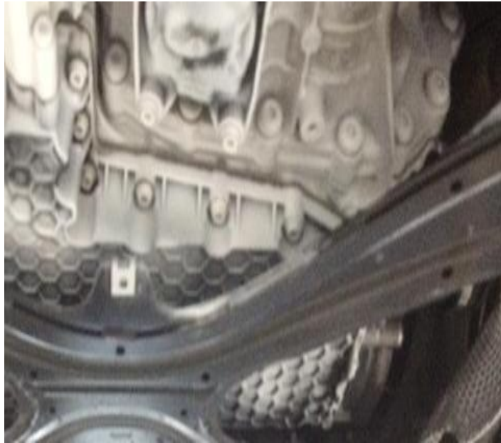
Figure 2: Transmission with oil leak detection spray applied.