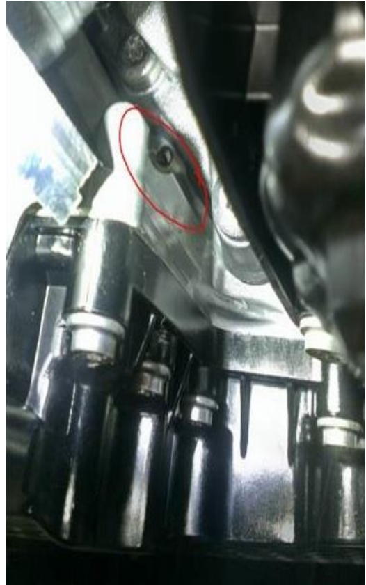
Figure 4. Double seal weep hole location.