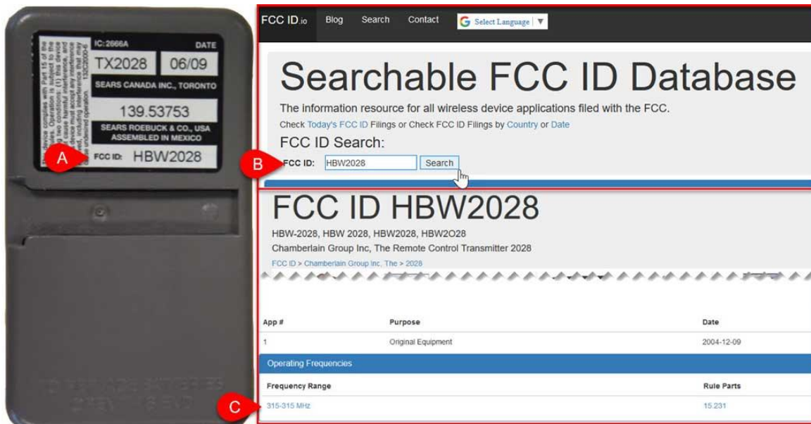
Figure 1. Checking the operating frequency.