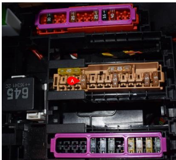
Figure 4. Fuse SF4 (5A): Q5 (FY) – Left Rear Trunk.